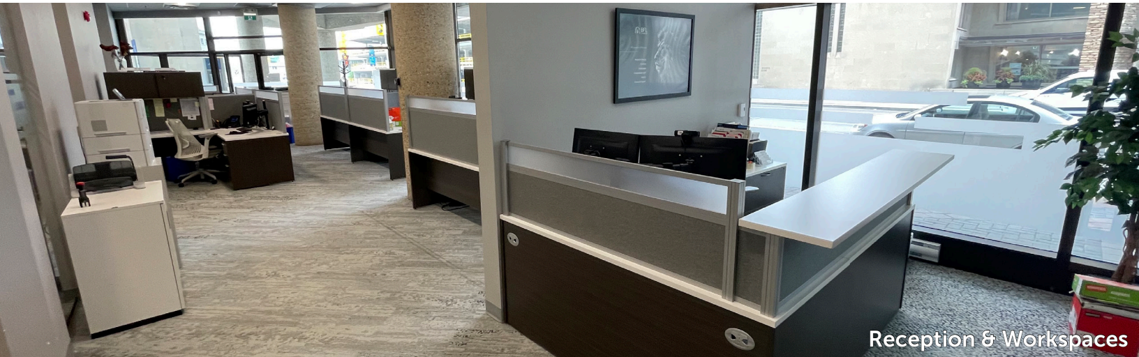
Reception & Workspaces